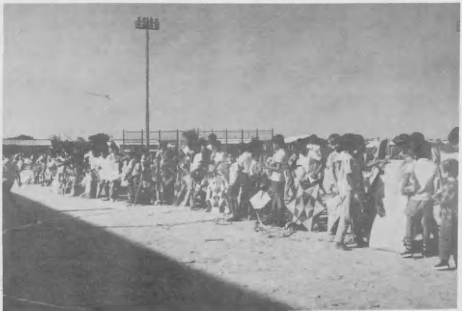
YMCA's kite contest at Sport Park April 26 - YMCA su concurso di flie, April 26.